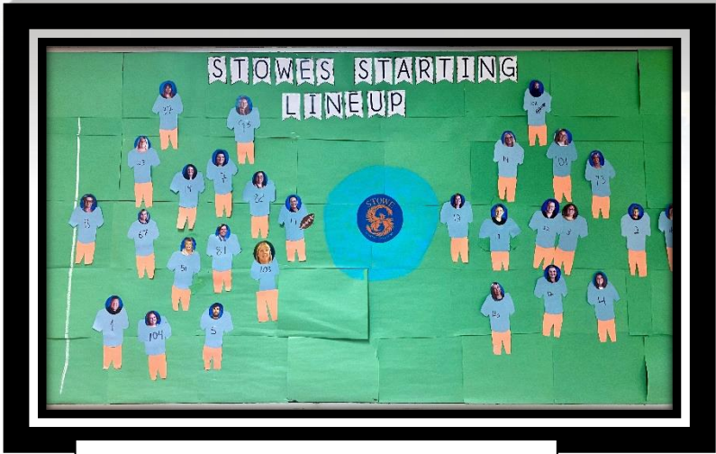
Stowe's Starting Lineup (staff football)