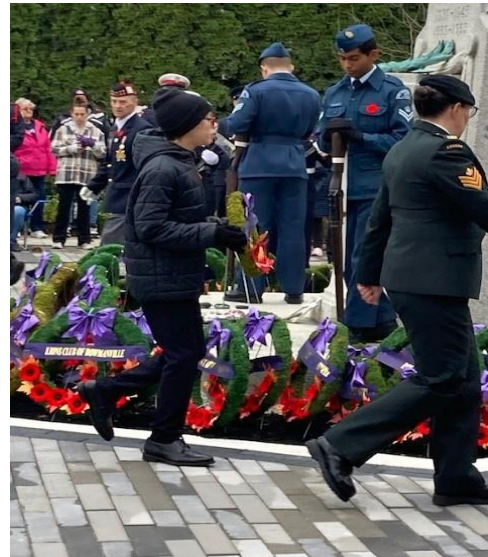
School's Class Wreaths